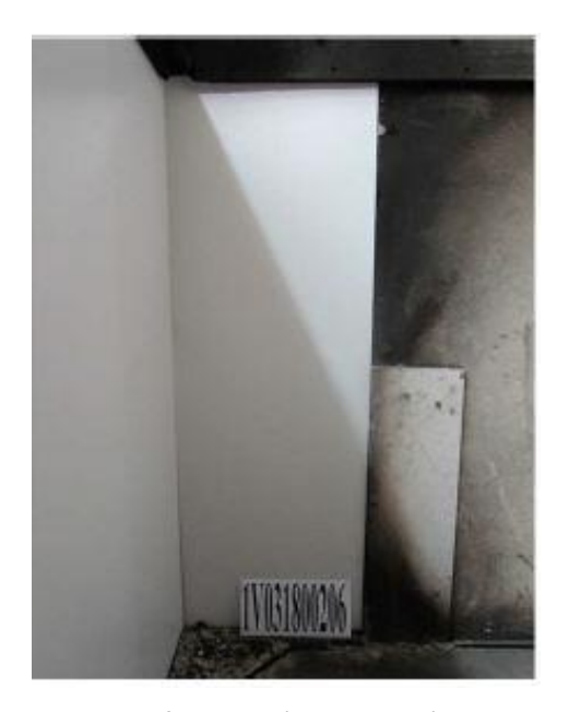
Before test (Short wing)