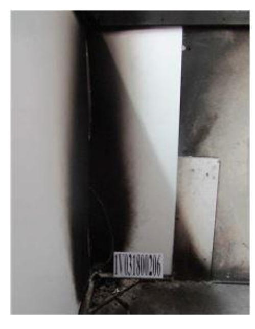
After test (Short wing)