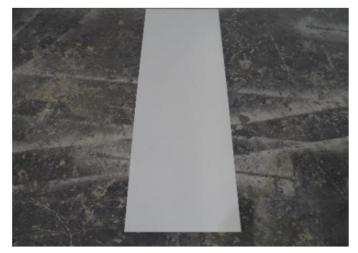
Front View(Test Face)