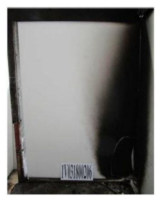
After test (Long wing)