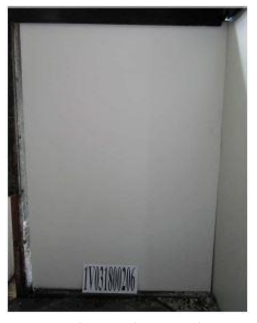
Before test (Long wing)